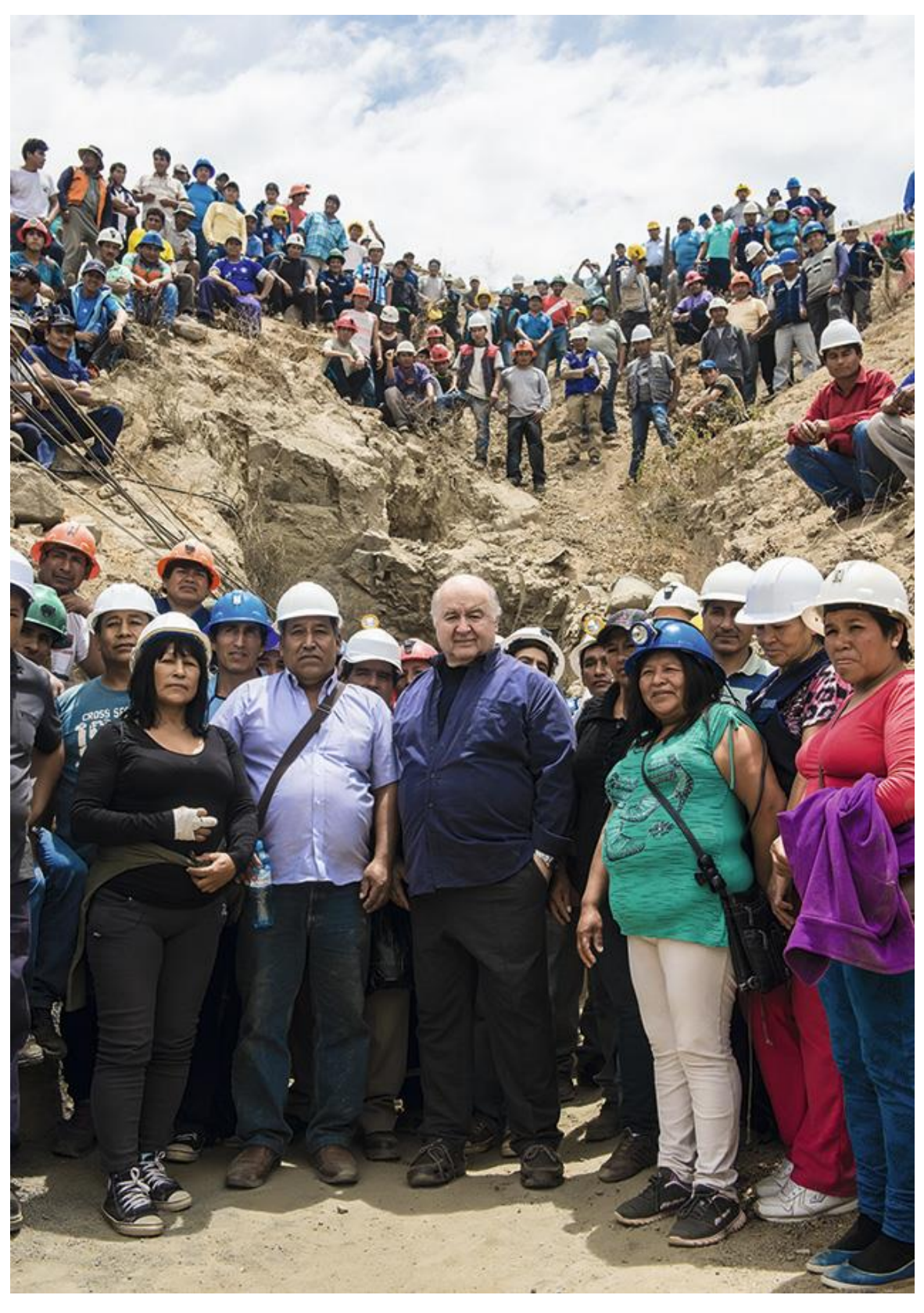
Jicamarca (Lima), November 2015