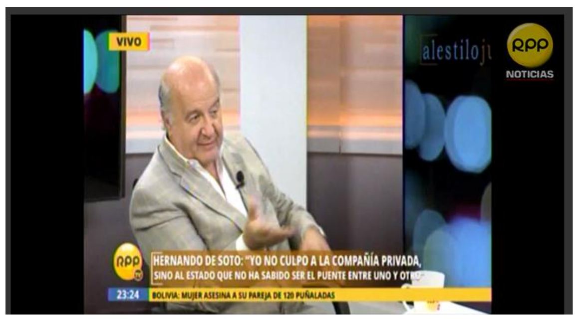
El economista peruano Hernando de Soto explicó al detalle en RPP Noticias lo que considera el origen del problema en Islay y otros conflictos sociales.

El reconocido economista Hernando de Soto visitó el set de 'Al estilo Juliana' para explicar el origen del problema en Islay, el porqué del rechazo de los agricultores a la minería y el contexto internacional sobre el que se manejan estas protestas.