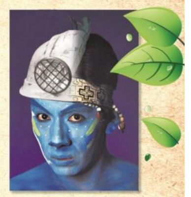
Here on the coast, in the highlands, and in the jungle, we MINERS are also FARMERS