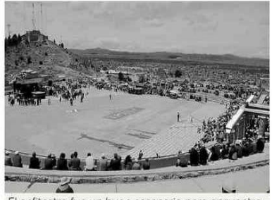
El anfiteatro fue un buen escenario para encuentro

de Soto asumió el compromiso de plantear otras vías para alcanzar la buscada formalización de todos.