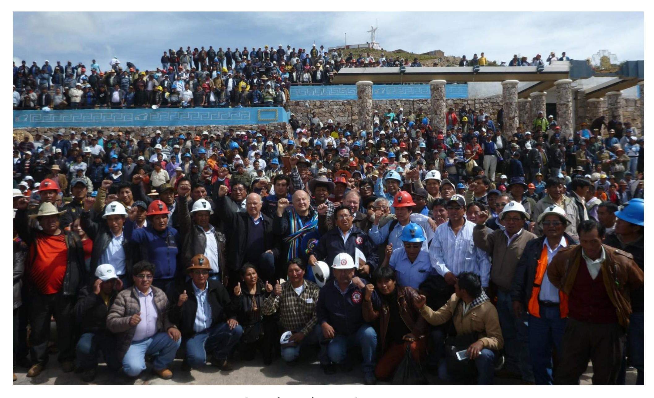
Juliaca (Puno), March 16, 2015