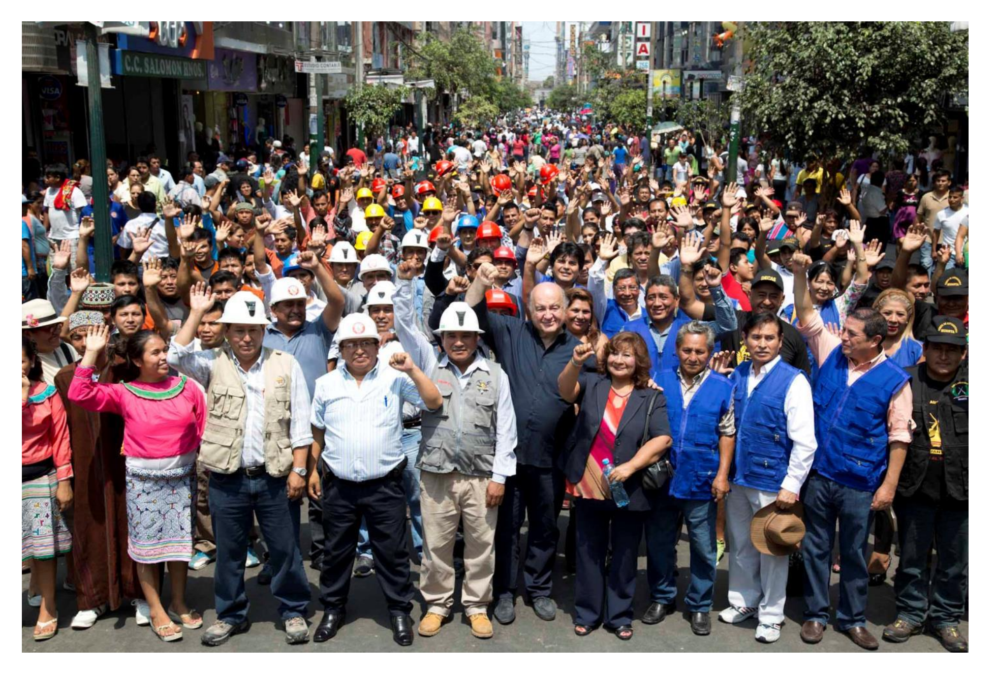
Gamarra (Lima), April 15, 2015