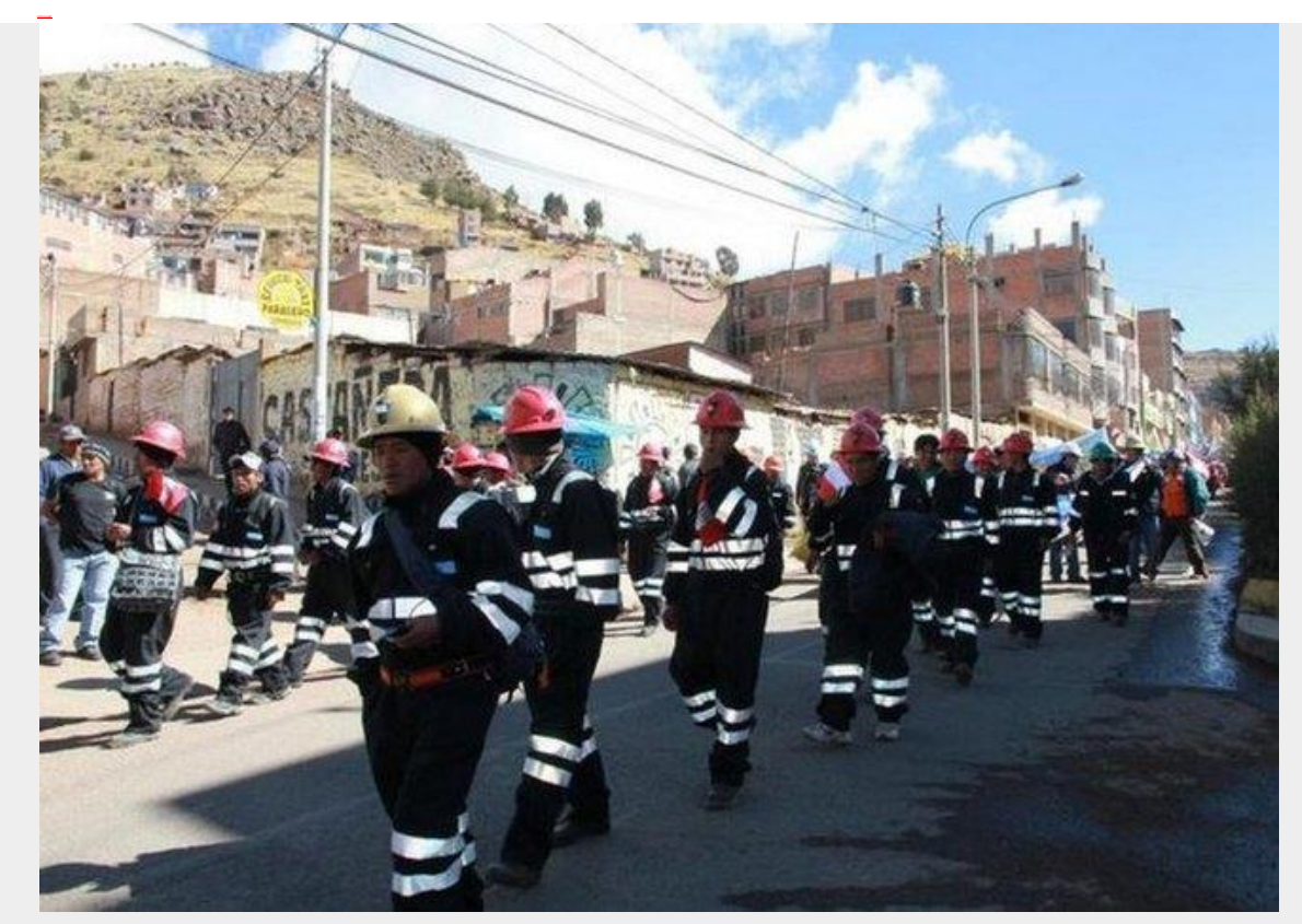
Un aproximado de 15 mil mineros se reunirán con el reconocido economista Hernando de Soto en Huayna Roque.

La Ciudad de los Vientos, será la sede del IV Encuentro Nacional de Pequeños Mineros y Mineros Artesanales, actividad que se desarrollará desde las 9:00 horas en la explanada del cerro Huayna Roque, a donde se darán cita además de los cerca de 15 mil mineros, el reconocido economista peruano, Hernando de Soto Polar.