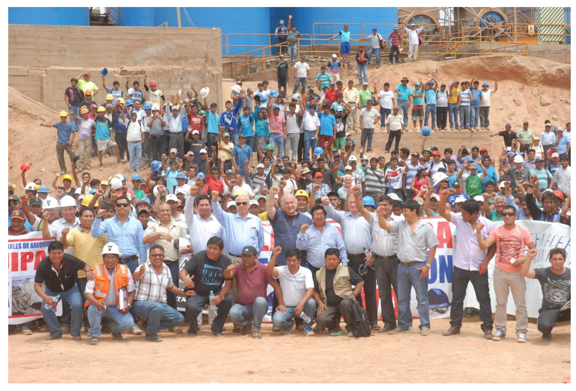
Chala (Arequipa), January 31, 2015