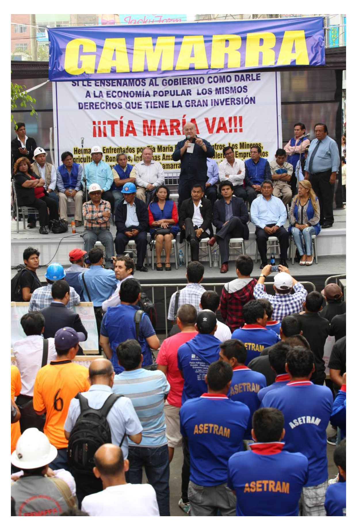
Gamarra (Lima), May 7, 2015