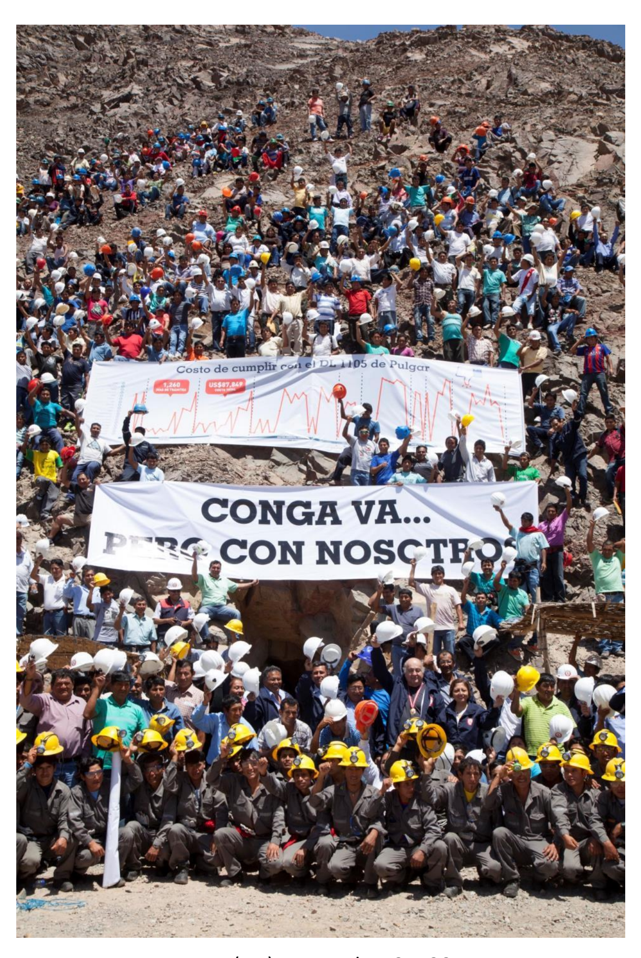
Nazca (Ica), November 21, 2015